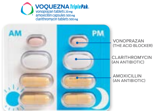
Pills not actual size.

Take your medication 2 times per day: in the morning and in the evening, 12 hours apart.